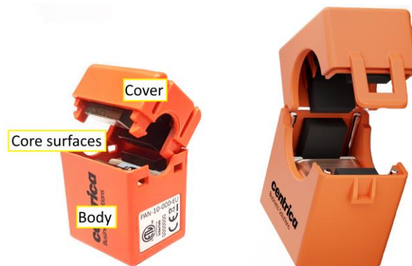
Figure 1. 63A

The sensors are shipped closed, in order to protect the core from dust and other pollutants. Open a sensor only when preparing to install it.