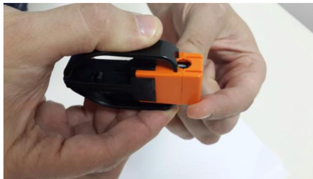
Figure 4. Slide opener into position