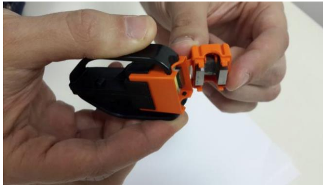
Figure 5. Press the opener to release the cover.